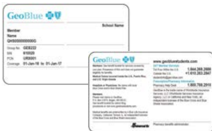
ID card images for illustration purposes only